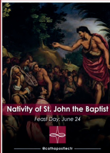
Nativity of St. John the Baptist